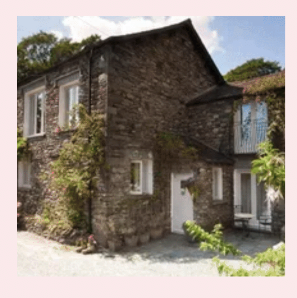
Hart Head Barn