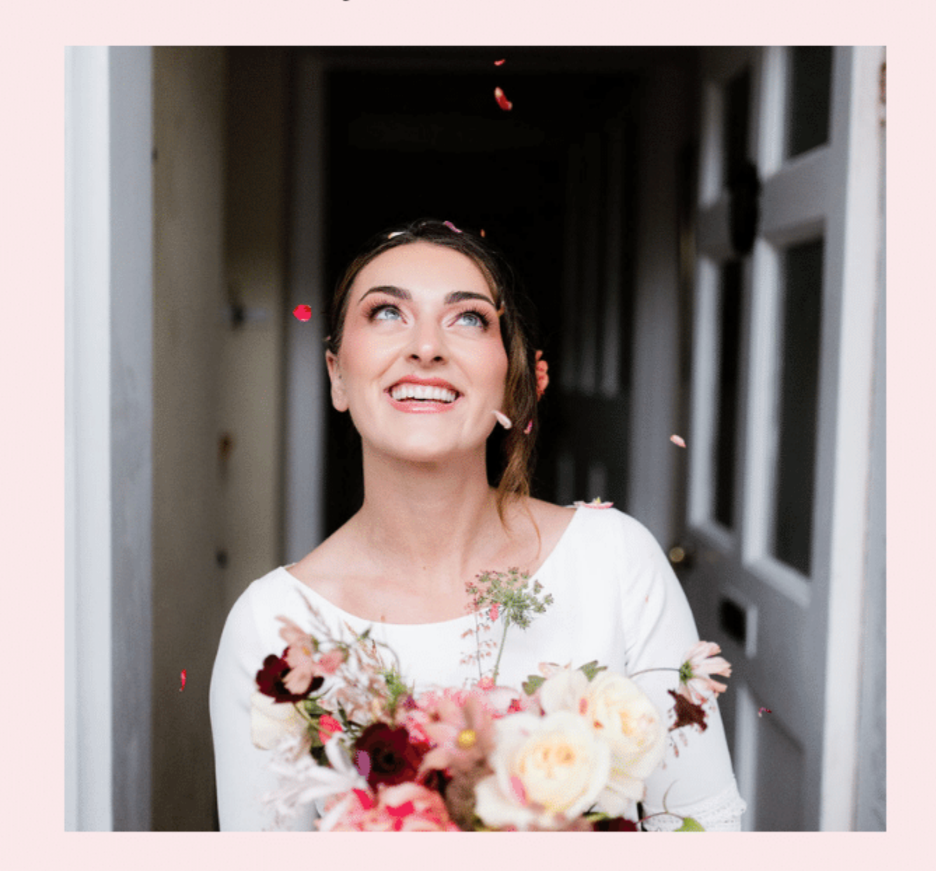
Romantic Lake District Wedding Venue www.rydalmount.co.uk